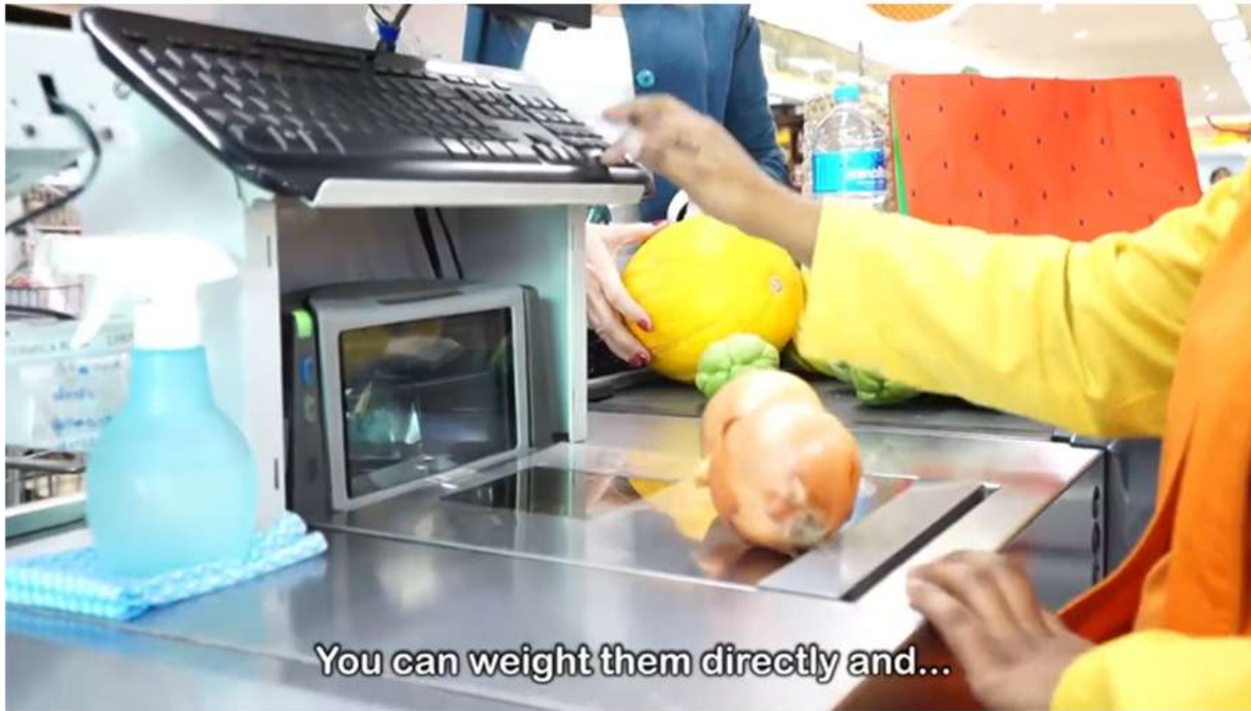
You can weight them directly and...