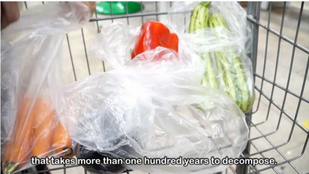
that takes more than one hundred years to decompose.