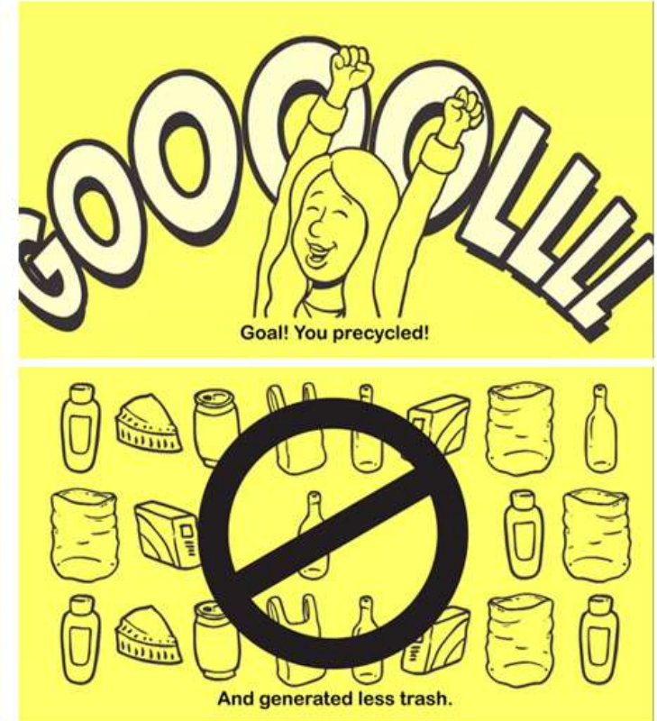
Goal! You precycled!