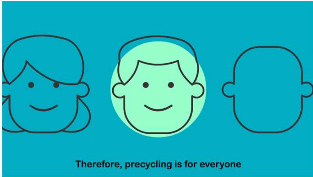
Therefore, recycling is for everyone