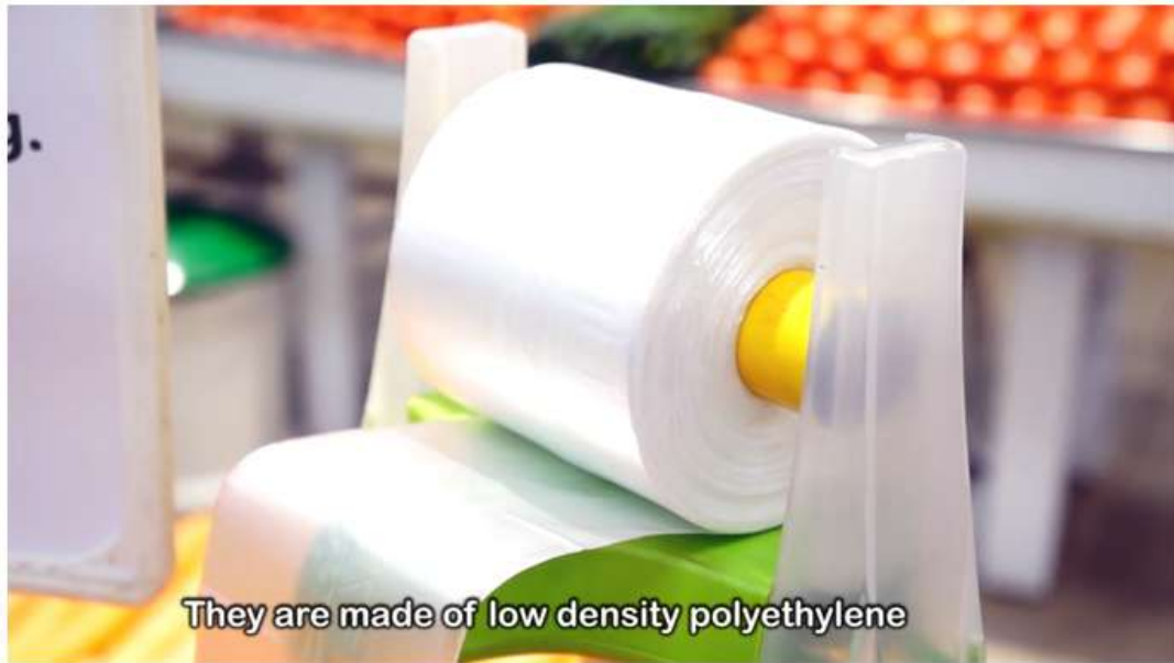
They are made of low density polyethylene